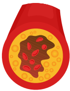
CHOLESTEROL BLOCKED ARTERY